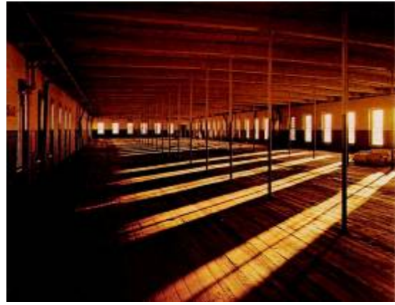
Figure 2&3: Left: Himeji Castle, Japan. A small fire extinguisher is visible in this all-timber structure. Right: Interior of the top floor of a ca. 1835 textile mill with “slow-burning” construction and brick walls, Amoskeag Mills, Manchester, N.H., USA photographed in 1968.

Fire? Earthquakes? Does one risk tend to be increased when the other is reduced? Why continue to build in wood in San Francisco when the city has burned down once already? Can timber construction once again find a role to play in the Istanbul where now millions of people live in very vulnerable concrete buildings? In the world to come – with the depletion of non-renewable resources including fossil fuels, timber may actually assume an ever increasing importance – even for urban multi-story buildings. Over past millennia, stone, timber and unfired earth have been our principal building materials. They all share two important features – they are abundant and require very little energy to be processed into building materials. Timber is also renewable and kilogram for kilogram, it is one of the strongest building materials available.