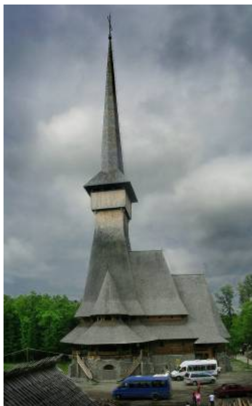
Figure 8&9: Left: The 67 meter high Sakyamuni Pagoda, constructed in 1056, China. Photo by Gisling (Wikipedia GFDL) Right: The 75 meter high Săpânța-Peri Monastery, Romania, constructed in 2003. Photos ©Luca Florin Gheorghe, www.poze-romania.ro ; combined into one by Randolph Langenbach.