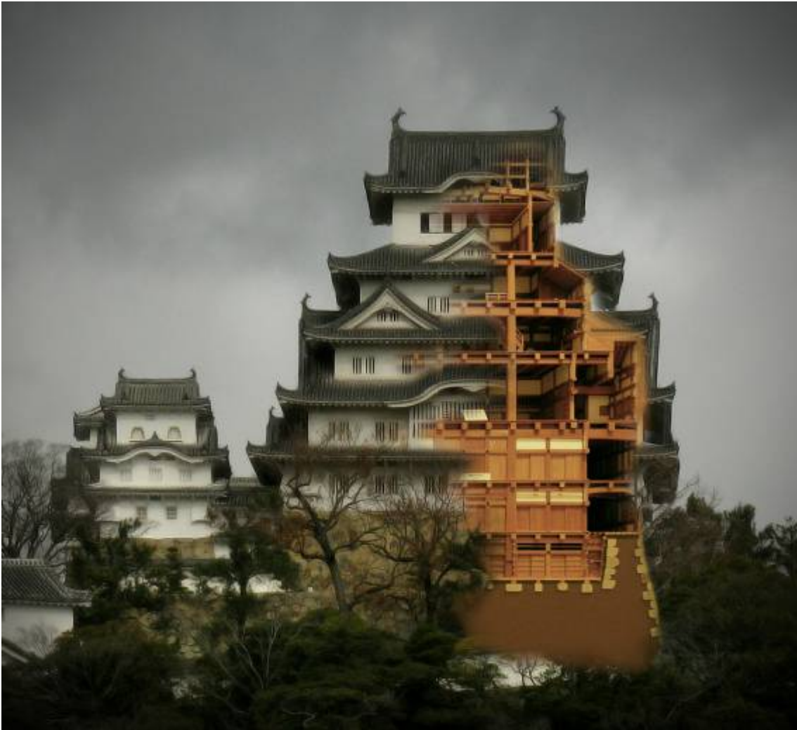
Figure 1: Seven-story timber frame Himeji Castle, Japan, 1608AD, overlaid with photo of model of interior timber frame structure.

An earthquake, however, can turn this vision of the strength of a masonry or reinforced concrete pucca house on its head. The lighter and seemingly weaker wood houses, even when their frames are infilled with masonry, have often demonstrated a greater resistance to collapse in earthquakes than those of masonry, and concrete. This is especially found to be true near the epicenters of particularly large earthquakes. For example, In the 1999 earthquakes in Turkey, the 2001 earthquake in Gujarat, India, and the 2005 earthquake affecting both Pakistan and Indian Administered Kashmir, the seemingly weaker timber and masonry infill frame houses generally performed far better as a class than did those constructed of reinforced concrete.