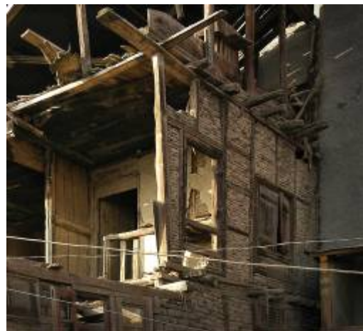
Figure 6&7: Left : Houses of traditional timber with mixture of timber-laced masonry (known locally as taq ) and timber frame with infill masonry construction, (known locally as dhajji dewari or “patchquilt wall” in old Persian) in Srinagar, Kashmir. Right : Partial demolition of dhajji dewari house reveals the timber frame and thin masonry wall construction.