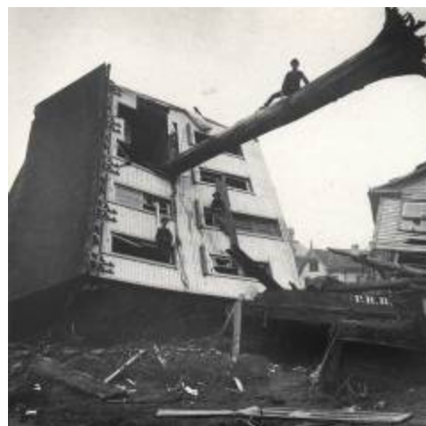
Figure 4&5: Left: Hand sawing of log into boards, 2006, a still common practice in rural Kashmir, India. Right: Balloon frame house washed downstream but remained intact when dam burst in Jonestown, Pennsylvania, 1889 killing 2209 people.