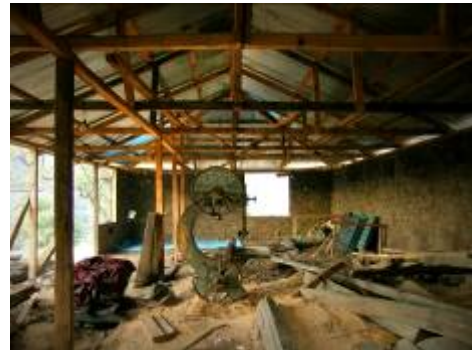
Figure 15&16: This dirt poor Pakistan Kashmir farmer who is rebuilding his house in the traditional dhajji dewari construction after the 2005 earthquake destroyed his rubble stone house. Not only is he doing the construction, but he is milling his own timber on the large old band saw visible in the photo of the interior on the right.