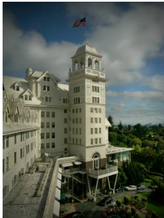
Figure 12&13: Left: Five and six storey Medieval houses in the Marais District of Paris, France, constructed beginning in the 14 th century, redone to their present form by the turn of the 16 th century, and restored in 1967, revealing the timber that had been plastered over. Right: The Claremont Hotel, constructed in 1906 in Oakland, California, USA has 11 storeys of occupancy in its tallest portion, including assembly spaces. The stone at the base is veneer onto the timber structure.

In any case, these thresholds were again known to have been exceeded in some congested Medieval towns, where again, as in Rome, the need for city walls drew a fixed perimeter around the town leaving the only direction for expansion to be up. As in Rome, the timber frame with masonry infill known in French as colombage , or in German as Fachwerk , proved to be suitable for tall construction because it eliminated the need for thick masonry walls at the base of the structures where often the shop fronts demanded more openness. It was also more economical to build, and allowed for larger room sizes upstairs as well. In the earthquake hazard areas in Eastern Europe, Greece, Turkey, and Kashmir, this form of construction continued to be used up